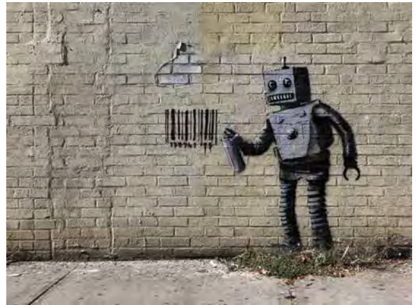
'Banksy'

Some students worked with a 2D physics engine to explore physics-based game-play in a simple Angry Birds-like game. They learnt the importance of maths and physics in modern computer games. Others explored robotics and the challenges and opportunities of BIG DATA and took part in presentations where questions were posed about why students might want to study at university, why we need new ideas and where they come from. Discussions encouraged students to think critically in a world that continues to be transformed by new technologies, applications and services.